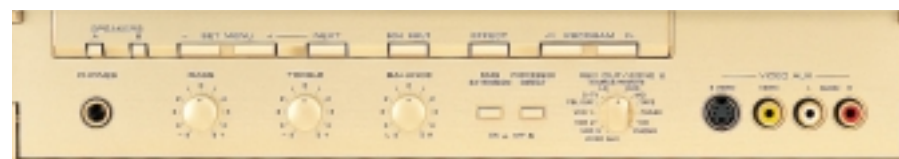
DSP-AX1 Oil-Damped Hidden Control Panel