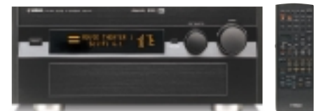
Black finish available